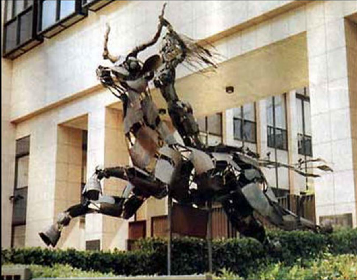
Statue in front of the EU Headquarters in Brussels, Belgium