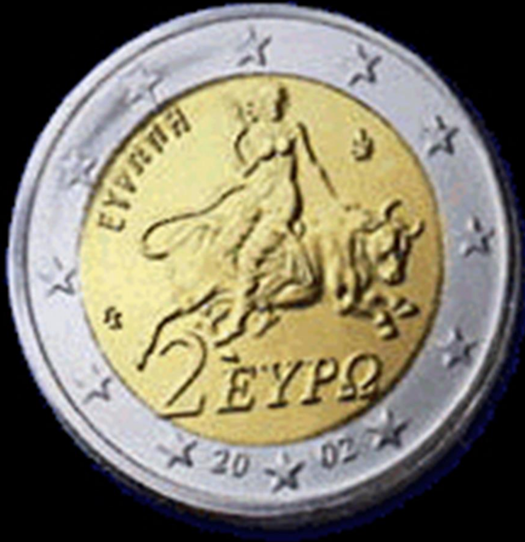
A 2 Euro coin was released in Greece that depicts a woman riding a beast