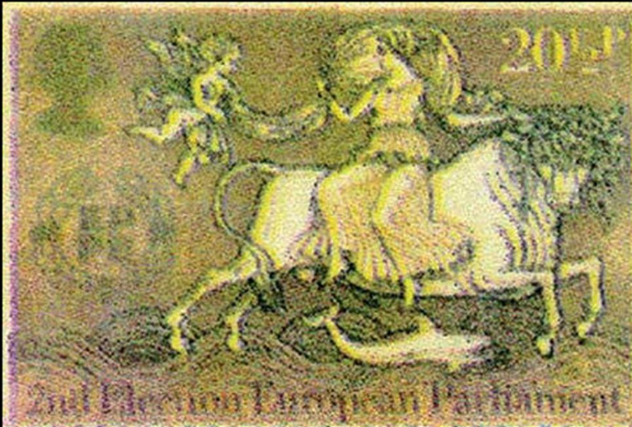
Stamp commemorating the second election of the European Parliament in 1984 – same theme -- a woman riding a beast