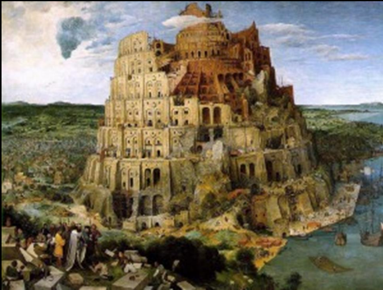
“The Tower of Babel” by Pieter Bruegel, a Flemish Renaissance painter and printmaker, 1563