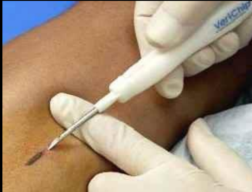
Inserting the chip