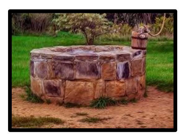
Great Stories of the Old Testament # 91

Well, Well, Well, Well Defeating Enemies Supernaturally